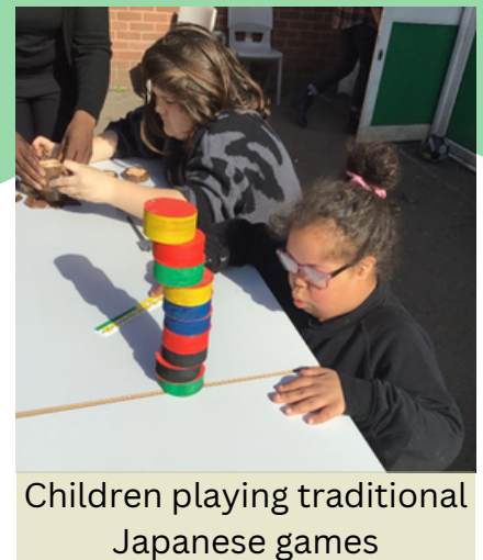
Children playing traditional Japanese games